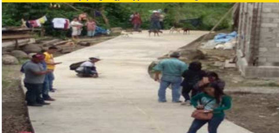
The resident-beneficiaries joining the project inspection team in measuring the local access road.