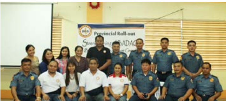
The participants to the Provincial Roll-Out on Strengthening of BADACs together with the MLGOOs and facilitators. #DILG-Apayao

LGOO II Dumalsin presenting the template to be used for the formulation of the BADAC Plan. She informed the participants of modifications made by central office on the template, specifically that of the inclusion of the issues and concerns column.