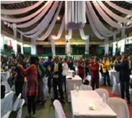
The participants performing the “Baby Shark” dance for their afternoon stretch before continuing with the activity.