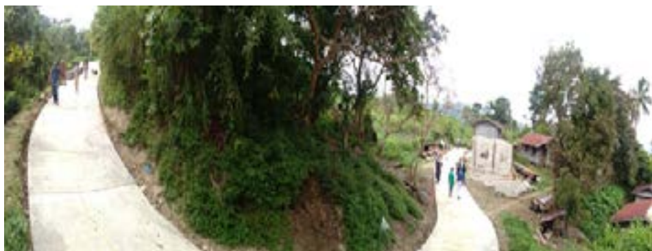
The FY 2017 Local Access Road project connecting communities in Bayayeng, Brgy. Pappa of Sablan, Benguet.